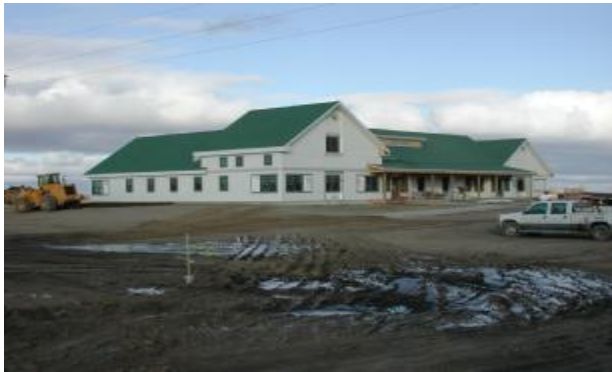
Vic Sturlaugson Learning Center

The $1M Vic Sturlaugson Learning Facility at the NDSU Research Extension Center was nearing completion at the end of 2003. The project has been in development since 1998. The new building will be used for agricultural and community education, regional meetings and video conferencing. In the future, the Research Extension Center will enhance its mission by developing value-added agricultural projects.